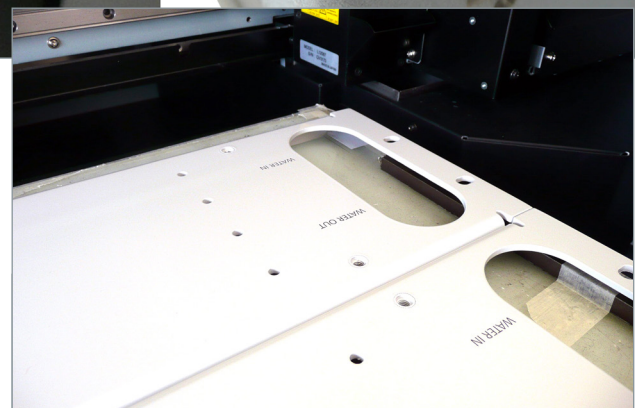
Direct to component printing

Screen printing of larger cases provides an accurate colourfast solution for both one offs and short runs and if the surface is flat - we can screen print it!