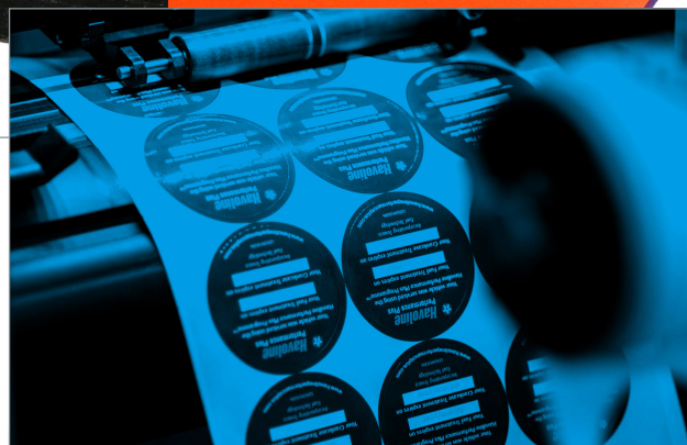
Wide Format Label Printing

Polycrown manufactures industry specific labels such as asset and security labels with options including barcoding and serialising plus over-lamination for added print protection.